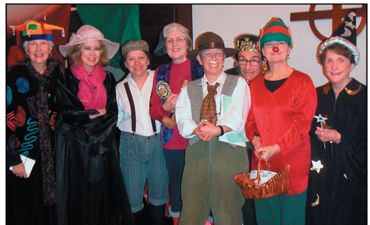
Jung Society Board and friends in costume for Christmas Party & Talent Night, December 2, 2008